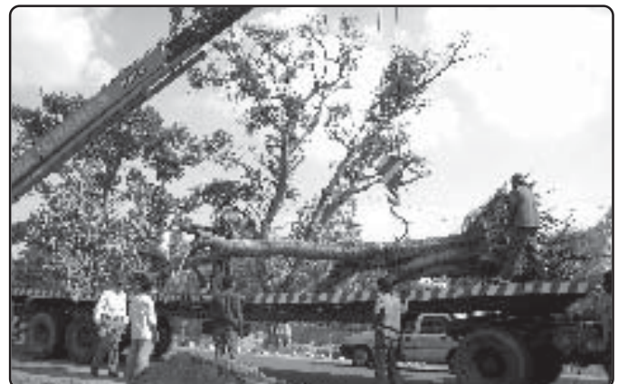
A tree is being transported to translocation site

Times of India's efforts has brought awareness widely about the aspect. This translocation have been encouraged by the Chief Secretary of A.P., from the word go.