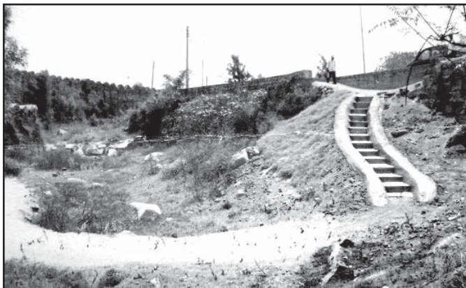
Pucca Staircase constructed illegally from Moat wall and pathway to Surang

Extracts: We learnt that you had removed the pucca staircase from the moat wall and leveled the surface of the slope. We have come to know, however, that the Hyderabad Golf club has again built a kuccha staircase by using the earth and stones brought by you for filling up the hollow inside of the moat wall earlier broken by the golf club. Please, therefore, take steps immediately to