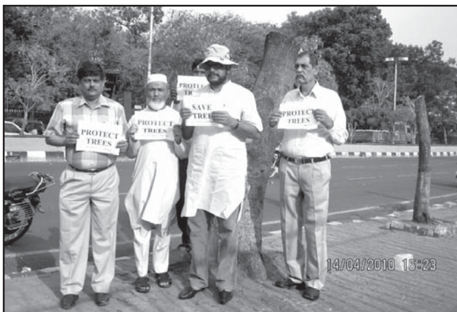
Protest against felling of trees in front of A.P. Secretariat

Readers interested in helping the FORUM by participating in its activities and/or becoming its member, will please contact the Forum by E-mail/Phone/Letter.