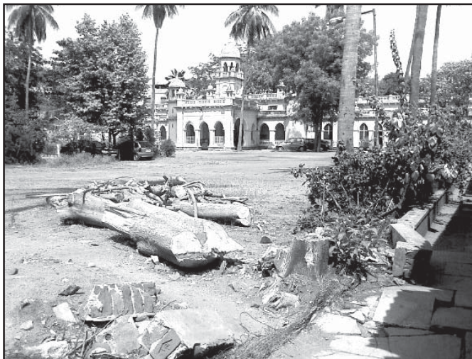
Felling of trees in the premises of Victoria Maternity Hospital

approval of Forest Department. Repeated violations of the WALTA Act and the GO Rt. No. 539 are taking place. This is disturbing. The Forum For A Better Hyderabad & many other NGO's severely condemn such action and demand an investigation to determine responsibility and to take deterrent penal action against the guilty. Adequate preventive measures against recurrence must be taken. Meanwhile these stubs must not be uprooted, instead grown. Compensatory plantation must be made where necessary as per guidelines.